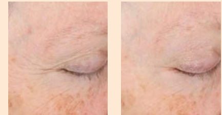
Crow's feet Baseline